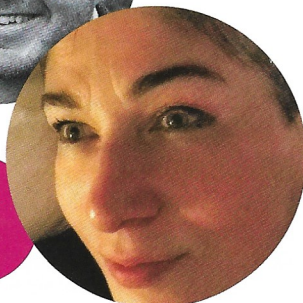
Joanne Harris OBE

Joanne Harris OBE, makes a welcome return to the Wetherby Festival. Since publishing 'Chocolat' in 1999 (which became an Oscar-nominated film starring Juliette Binoche), Joanne has written 19 other novels plus novellas, short stories, screenplays, the libretto for an opera and a stage musical, not to mention three cookery books. She has also won numerous awards and honours for her writing. Her latest book 'Broken Light' was published earlier this year. Event sponsored by Hartlaw LLP. Tickets: £35.